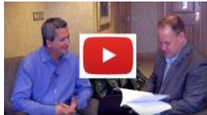
Click to watch Drew's VSM Interview